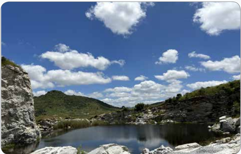
It is here, the Diocese would like to build a shrine as a pilgrimage centre.