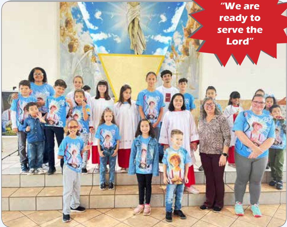
Altar boys and girls MSFS Parish St. Theresa of Child Jesus, Londrina, Brazil