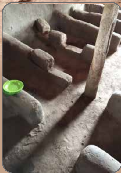
Floor and Pews - all MUD