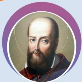
St. Francis De Sales MSFS PATRON