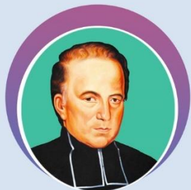
Fr. Peter Mary Mermier MSFS FOUNDER