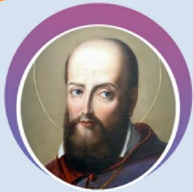
St. Francis De Sales MSFS PATRON

Let the conclusion of the 400 years of the passing away of St. Francis de Sales remind us of his great virtue of non-violence (gentleness) to oneself and to others. He says " Nothing is so strong as gentleness, nothing so gentle as real strength ". To be non-violent (gentle) we have to work on our own inner spiritual resources so as to have a happy life on this earth as well. May the celebration of his feast remind us gently of pursuing the path of holiness as envisaged by St. Francis de Sales and thereby sanctifying the world. Live Jesus!