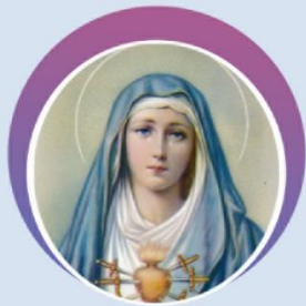
Mother of Sorrows MSFS PATRONESS