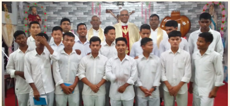
Initiation to the Novitiate