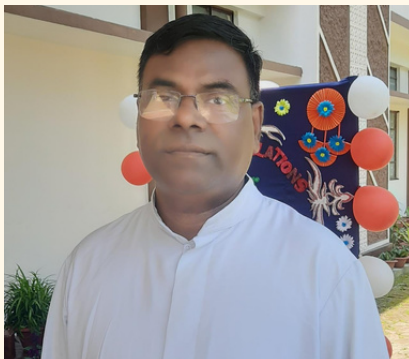
New Novice Master