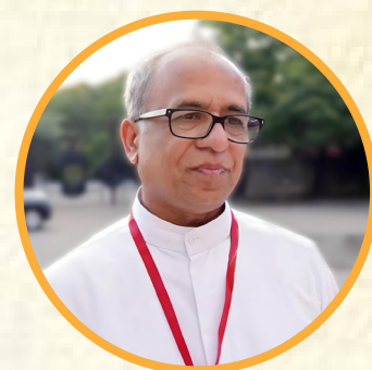
Bishop Malcolm Sequiera Diocese of Amravati