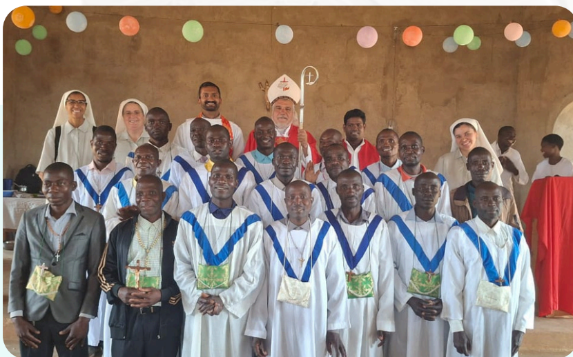
Bishop and Missionary Team with Newly Installed Ministers of Communion