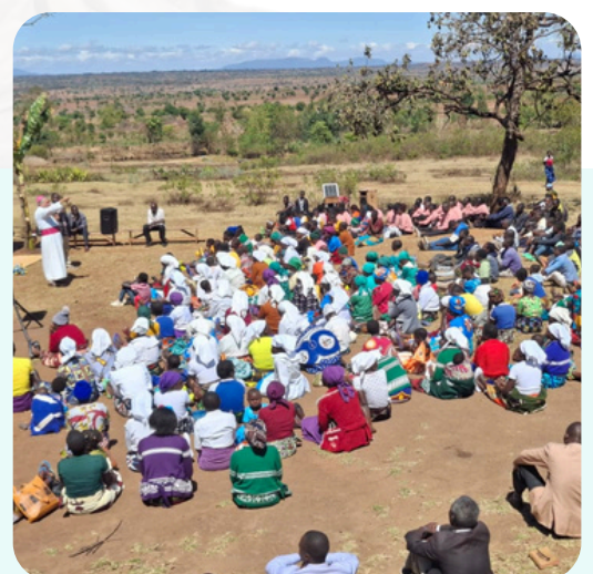
Bishop Conducting Catechesis