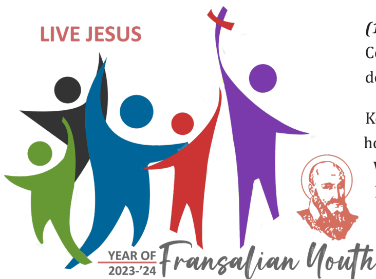
Logo for the Year of Fransalian Youth

Very Rev. Fr Superior General has declared the YEAR OF FRANSALIAN YOUTH (16 April, 2023 to 31 March, 2024) for the Congregation of the Missionaries of St. Francis de Sales.