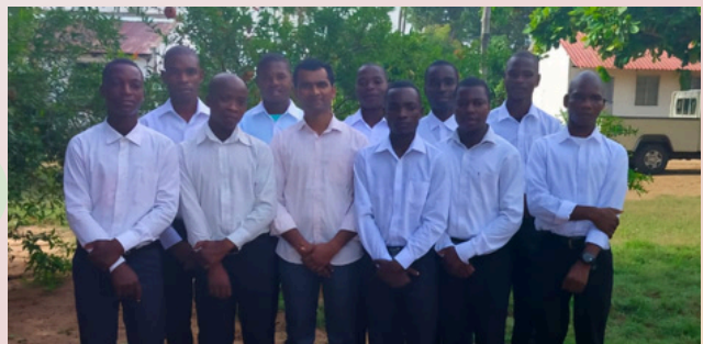
Minor Seminarians Mozambique Delegation