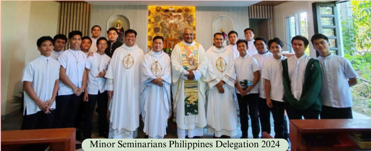
Minor Seminarians Philippines Delegation 2024

I am profoundly grateful to all the Provincials, Regional, Delegation, and Mission Superiors, Provincial Councillors in charge of Formation, Rectors, Novice Masters, Formators, Spiritual Directors, Vocation Promoters, and all the MSFS Confreres for their sincere cooperation, commitment, hard work and dedication to promoting vocation, forming, guiding, directing and accompanying our formees in different stages of formation.