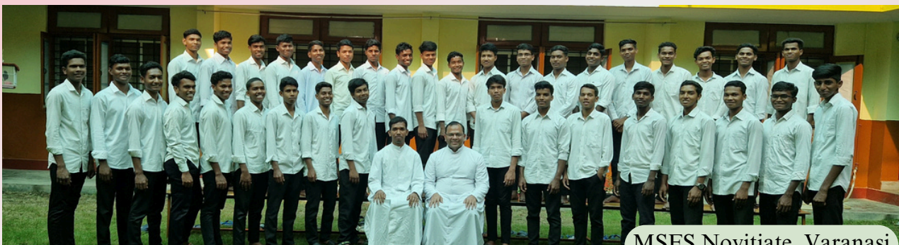
MSFS Novitiate, Varanasi