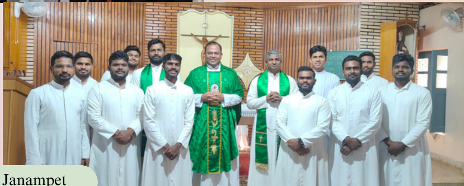
SFS Study House, Janampet