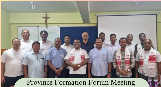
Province Formation Forum Meeting Dibrugarh & Guwahati