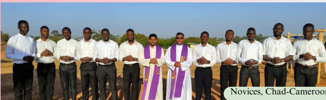
Novices, Chad-Cameroon Delegation