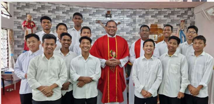
MSFS Novitiate, Chabua, Assam