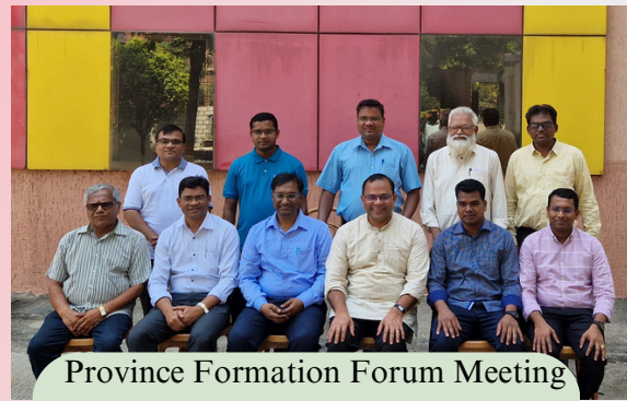
Province Formation Forum Meeting Nagpur