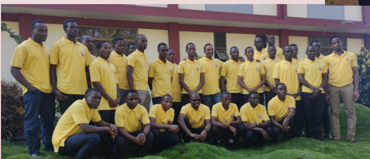
LCI Students 2024