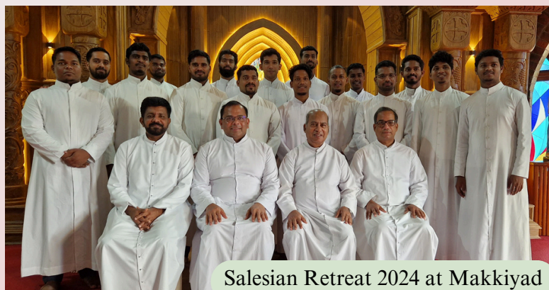
Salesian Retreat 2024 at Makkiyad