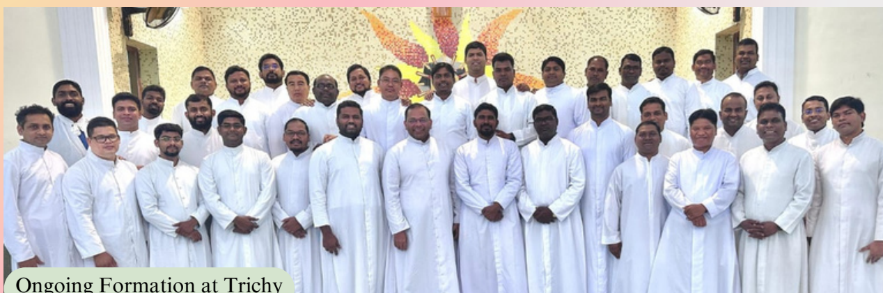
Ongoing Formation at Trichy