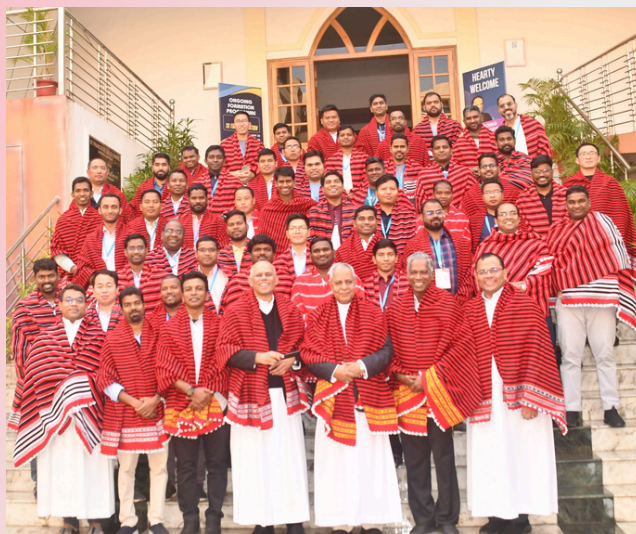
Ongoing Formation at Guwahati

Formation is an ongoing process in our fast-changing world, and constant updating in various areas of our lives becomes necessary to keep abreast of new developments and remain relevant, effective, and creative in our ministries. Remaining faithful to the Directives of General Chapter 2019, the General Secretariat for Formation, in collaboration with the Guwahati, Visakhapatnam, and Southeast India provinces, conducted three congregational-level ongoing formation programmes under the theme “A Call to Transformation.”