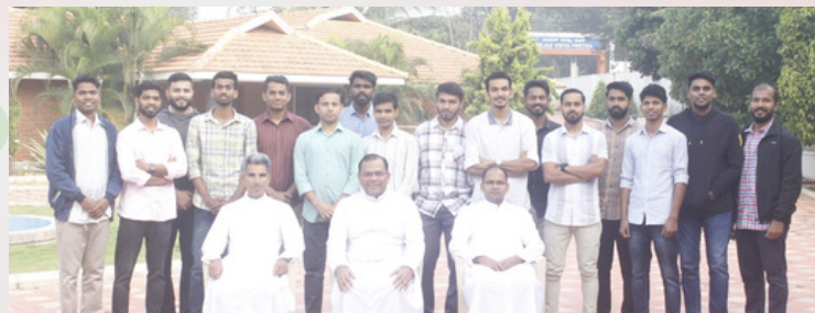
Tejas Vidya Peetha, Bangalore